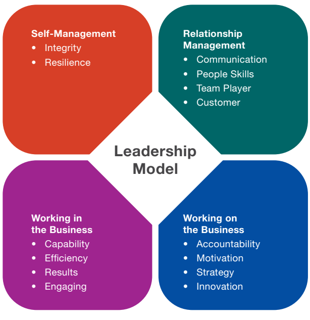
Figure 1. The Hogan 360 Leadership Model

This study focuses on data from the scaled items, as well as the ranked items designed to identify top strengths and top opportunities to improve.