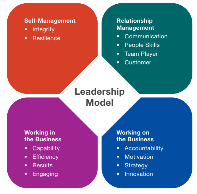
Figure 1. The Hogan 360 Leadership Model

To assess whether there were differences between Australia and the rest of the world, independent samples t-tests were conducted with a p-value set to .05.