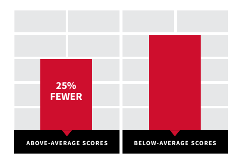
Unsafe Work Behavior Citations

Hogan collected safety data from 789 employees in a national postal and parcel delivery organization. These employees worked in jobs that involved receiving, transporting, and delivering packages. Our findings showed that employees who tend to be easily sidetracked (low Vigilant) and hard to train (low Trainable) were more likely to have citations for "unsafe work behaviors" than those who tend to stay focused on the task at hand (high Vigilant) and enjoy learning (high Trainable). Across all scales, employees with above average safety scores had 25% fewer citations for "unsafe work behaviors" compared to those with below average safety scores. By hiring only individuals with above average safety scores, the company could have reduced its number of citations by 15%.