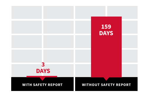
Employee Days Lost or Restricted

We collaborated with a national food manufacturer to examine the Hogan Safety Report's impact on reducing new employee safety incidents. Over a 16-month period, the company compared 400 employees hired before the implementation of the Safety Report to 178 employees hired after its implementation. Those hired with the Safety Report not only had 40% fewer accidents, but their accidents resulted in only 3 days lost or restricted compared to 159 days for those hired without the report.